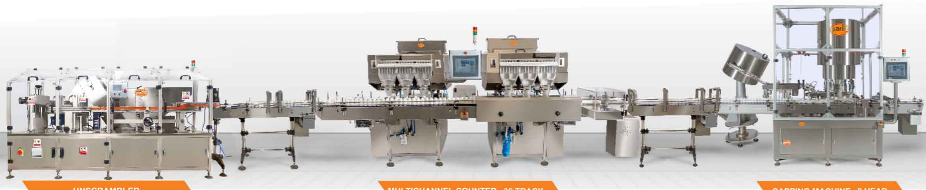
Monoblock Fill - Seal - PMFS 30 Versatile Compact Bottle-Filling System